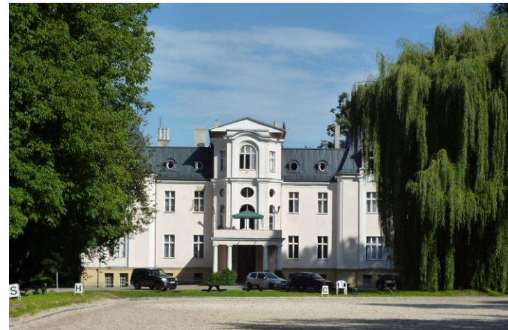
Residence of the club